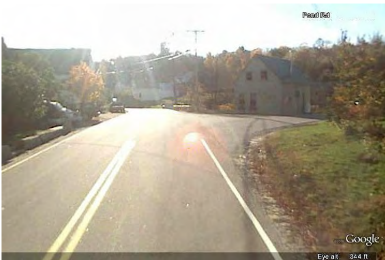
Approaching Seavey Corner Road from the north and east. If coming from the east on Belgrade Road, at JCT 41 (previous photo) pass the Country Store on your left and continue on Route 41 (Pond Road), proceeding a few hundred yards over a bridge and turn right on Seavey Corner Road just before “The Corner” novelty shop (building on the right in photo).