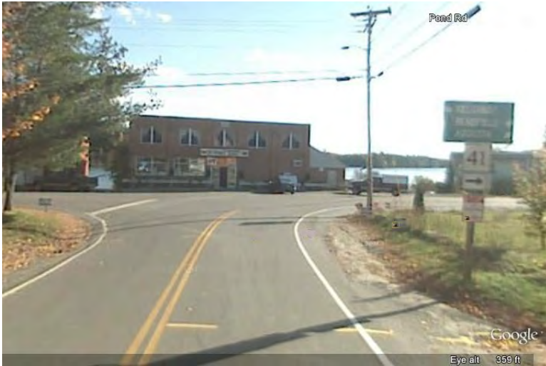
The Country Store in downtown Mount Vernon. If coming from the north on Route 41, turn right on Pond Road at the Country Store. (In photo Belgrade Road is on the left; Route 41 continues right). Continue south a few hundred yards over a bridge and turn right on Seavey Corner Road. “The Corner” novelty shop is on the corner (see next photo).